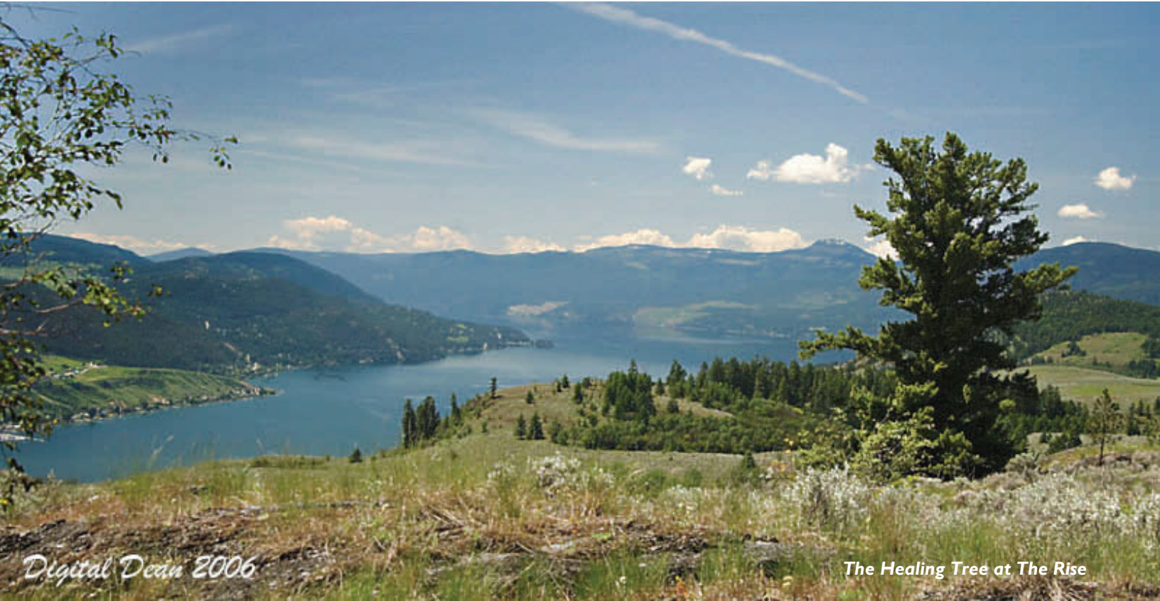
Digital Dean 2006