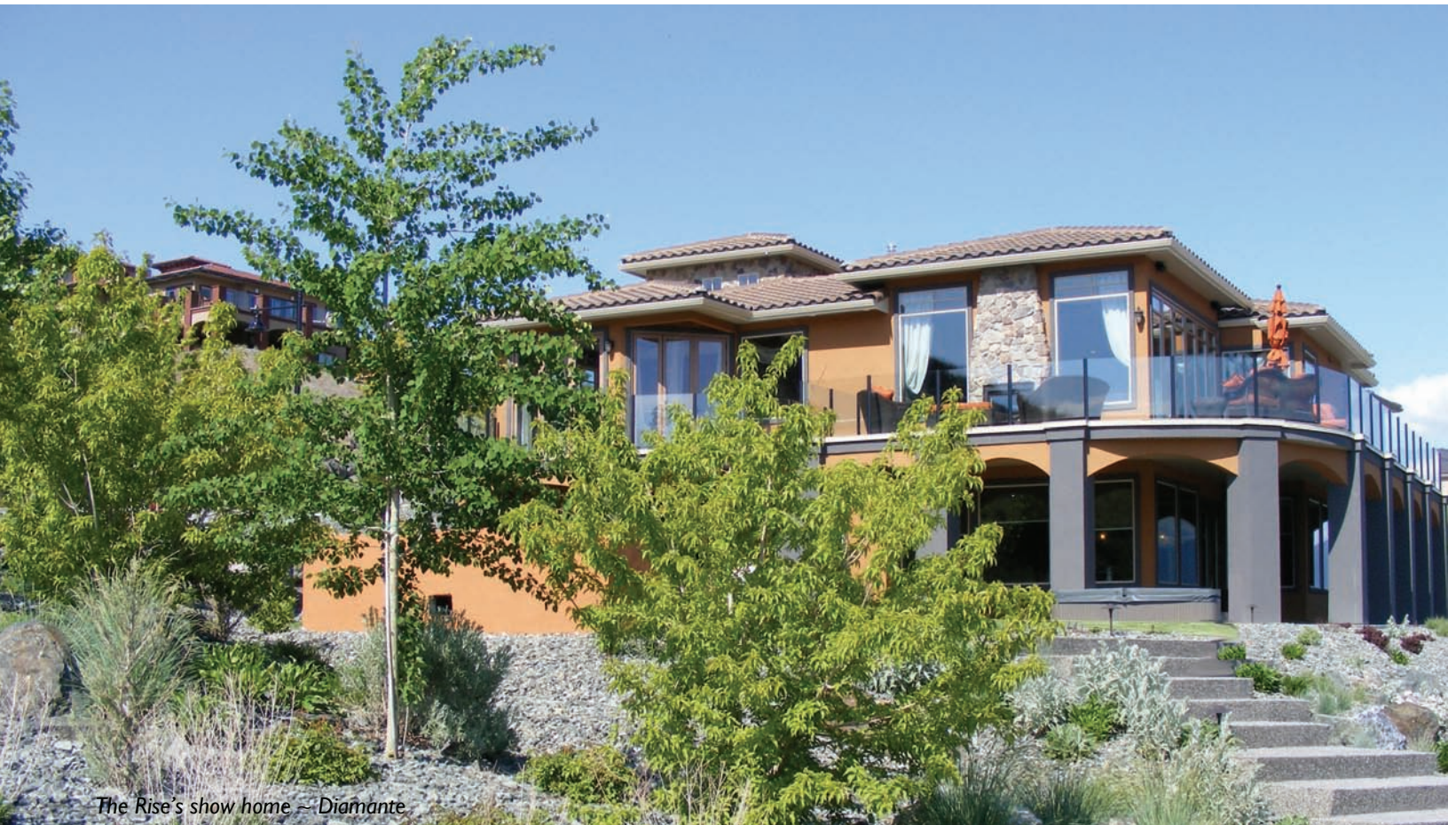
The Rise's show home ~ Diamante