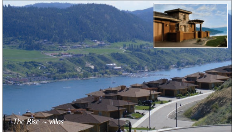
The Rise ~ villas