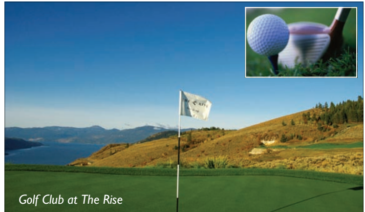
Golf Club at The Rise